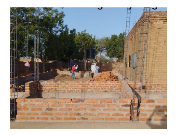
Lent Project 2025 Help us to 'Raise the Roof'

To find out more about what's going on at St Giles go to Events on MyChurchSuite or <u>click</u> here.