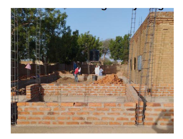
Lent Project 2025 Help us to 'Raise the Roof'

To find out more about what's going on at St Giles go to Events on MyChurchSuite or <u>click</u> here.